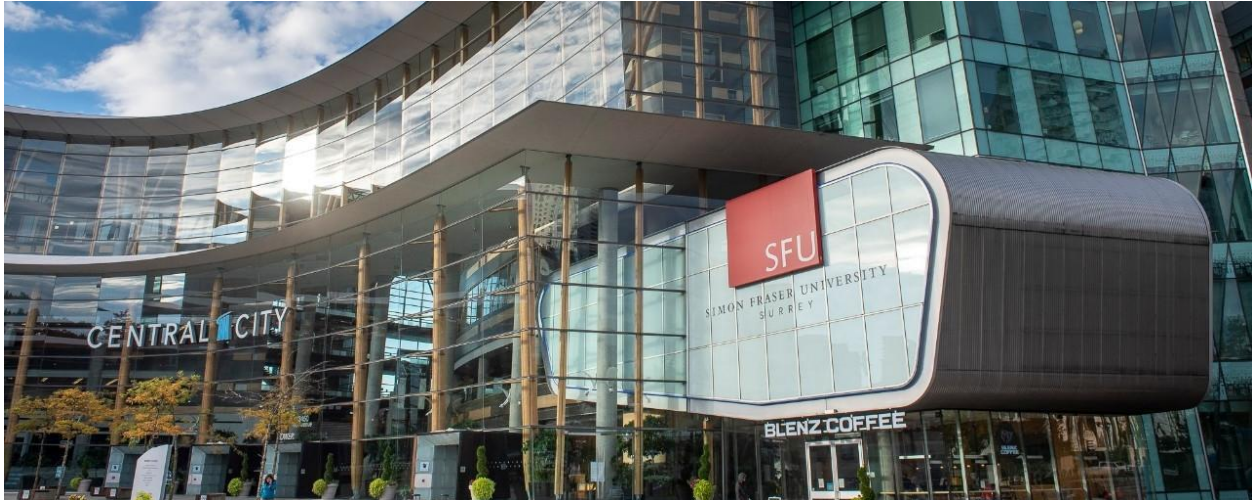
Photo of Simon Fraser University (SFU) at Central City